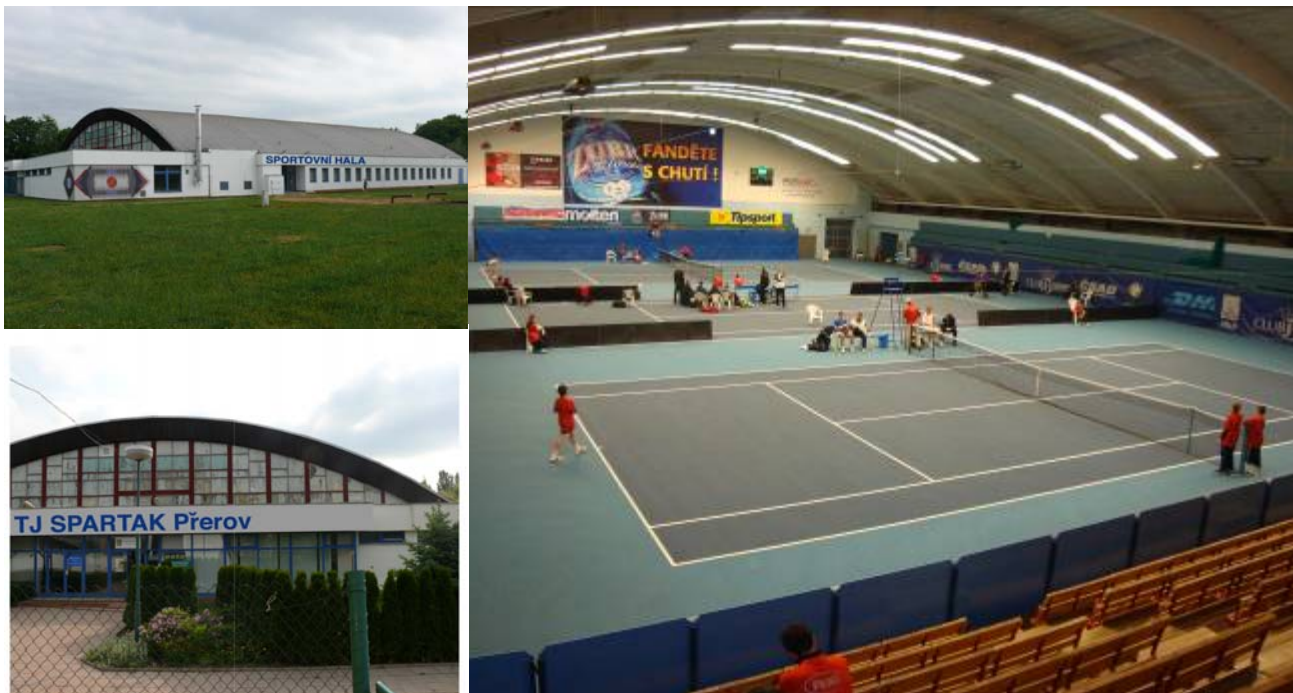
(3 courts with Courtsol Comfort surface)